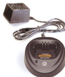
WPLN4139 – Rapid Desktop Charger (Euro) WPLN4140 – Rapid Desktop Charger (UK)