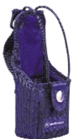
HLN9701 – Nylon Carry Case

Designed with small and medium-sized warehousing, agriculture, security, light industry and services customers in mind, the four channel CP040 requires minimal training and keeps team members in touch without distracting them with complicated features. Management can monitor all voice traffic and get a message to the team in seconds, however large the site.