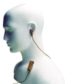
HMN9754 – Two Wire Beige Earpiece with Combined Microphone and PTT